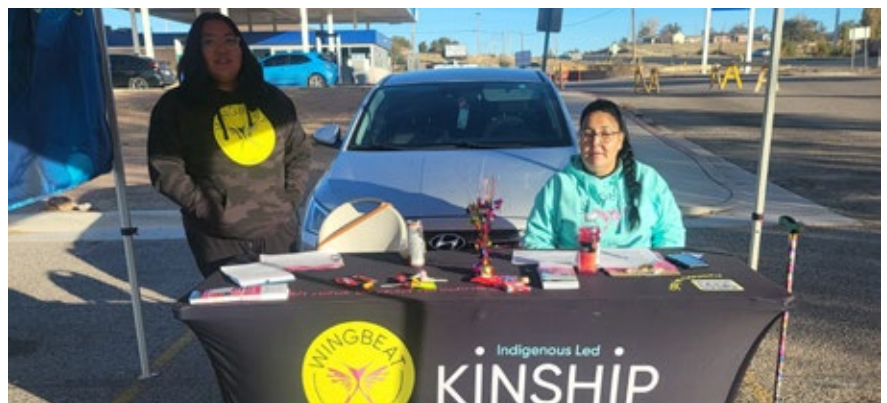
Wingbeat 88 activists register voters in their community