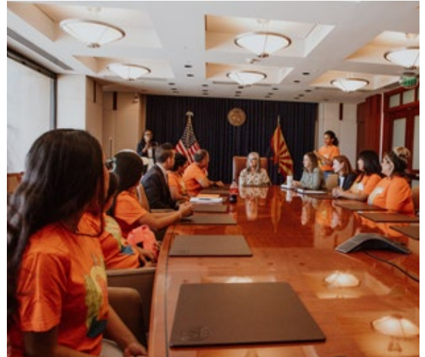
Chispa Arizona's Plantando Semillas Youth Program meets with Governor Hobbs to talk about heat resiliency in their communities

In 2024, Plantando Semillas participants began confronting critical shade equity issues in the Phoenix area. The teens are working with their communities to apply for funds, plant shade trees, create water collection systems to keep the new trees alive, and collaborate with state lawmakers to address other ongoing challenges.