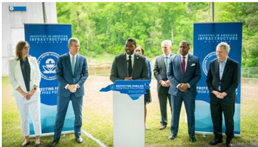
EPA Administrator Michael Regan announces new drinking water standards for PFAS.

LCVEF has been educating and mobilizing to push for regulation of PFAS since 2016, and in 2024, we succeeded when the Biden-Harris administration established the first-ever national drinking water standard for PFAS . The EPA rule holds chemical companies and other polluters accountable for the damage they have done to our health by dumping hazardous PFAS chemicals into our waters.