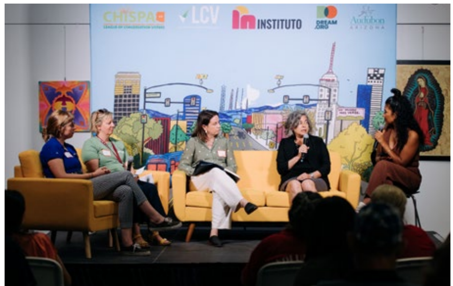
Chispa Arizona and partner organizations host an IRA Summit to engage the community on how to use IRA benefits and grant funding opportunities to mitigate extreme heat and other challenges

To date, Chispa Arizona has helped secure $15 million in IRA funding in collaboration with a community-based organization and the City of Phoenix. Funds will support parks, green spaces, green jobs, public transportation, and complete streets — which are accessible to pedestrians, bicyclists, motorists, and transit riders of all ages and abilities. Funds will also help mitigate urban heat islands , which are significantly warmer than the surrounding areas and pose health risks to vulnerable communities.