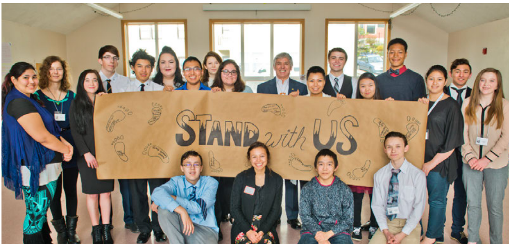
Leaders from Alaska Youth for Environmental Action (AYEA)

Our Boards and Commissions Fellowship program with the Alaska Center Education Fund (ACEF) is hiring a program manager this fall and will launch a fellowship in Spring 2025. ACEF has a long history of youth organizing around policy issues in Alaska, and we're excited to be part of another program that Alaska youth can join to continue on their leadership journeys.