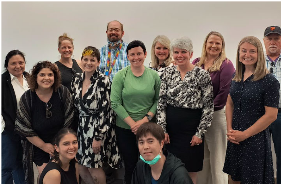
Idaho fellows attend a regional meet-and-greet with local appointed and elected officials

Our Boards and Commissions Fellowship Program Manager cohort (from six states) meets once a month to support each other, share ideas, and learn from one another. In August 2024, we discussed strategies for supporting fellows through the process of being appointed to a board or commission — for example, holding regional meet-and-greets with elected and appointed officials from different parts of a state, which has been effective in Idaho. At these gatherings, fellows learn about a wide range of appointed positions that they are eligible for and make connections that can help them to win appointments. Additionally, fellows are often less intimidated after meeting currently appointed officials and realizing that they are ordinary people (i.e., not that different from themselves). Each fellow is also assigned a mentor who can play an important role in helping them to explore and get appointed to a local board or commission.