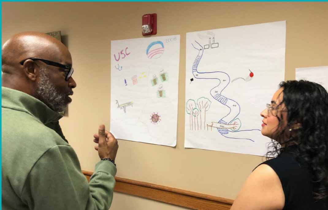
South Carolina fellows sharing their "river of life" drawings with one another